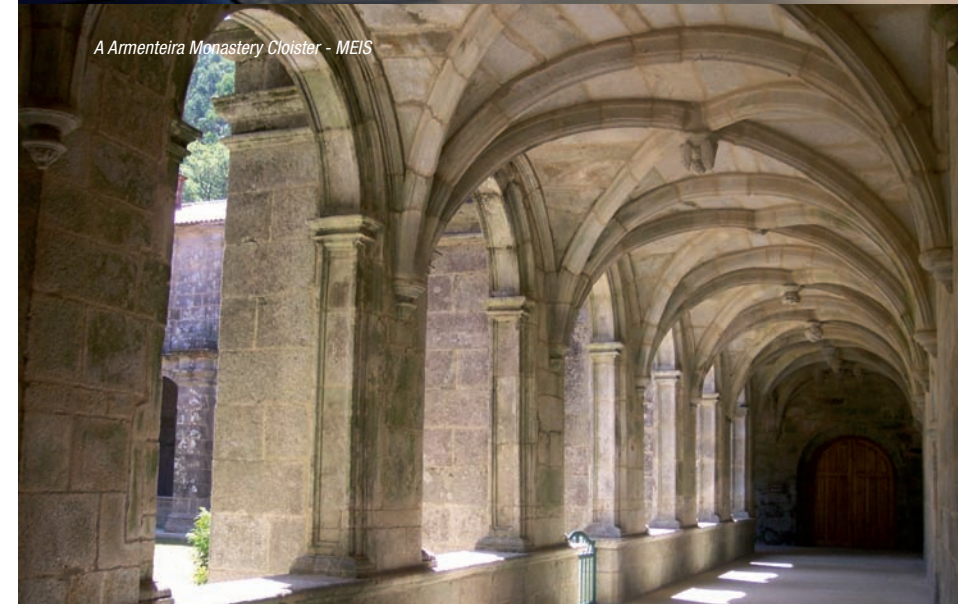
A Armenteira Monastery Cloister - MEIS