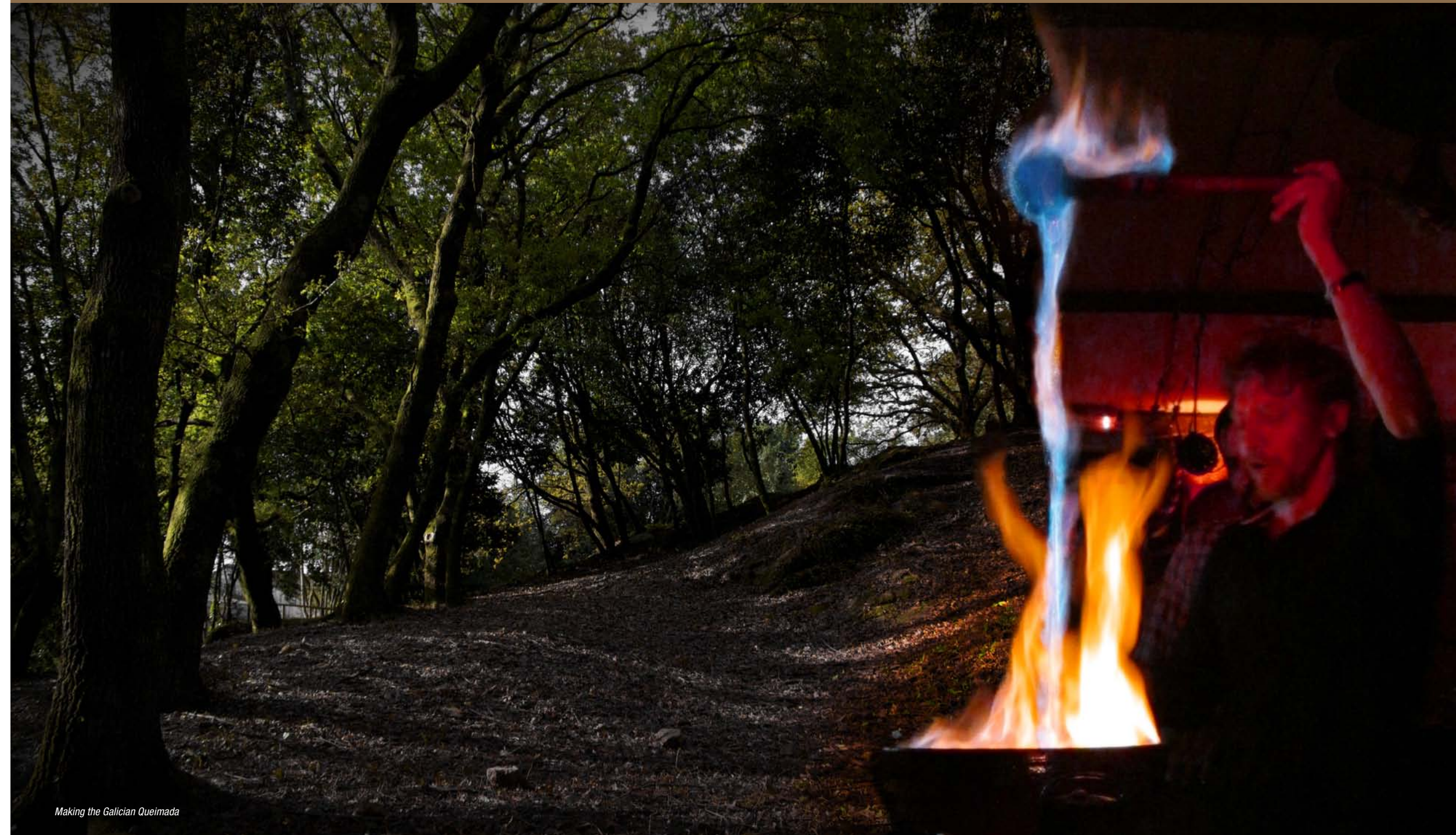
Making the Galician Queimada