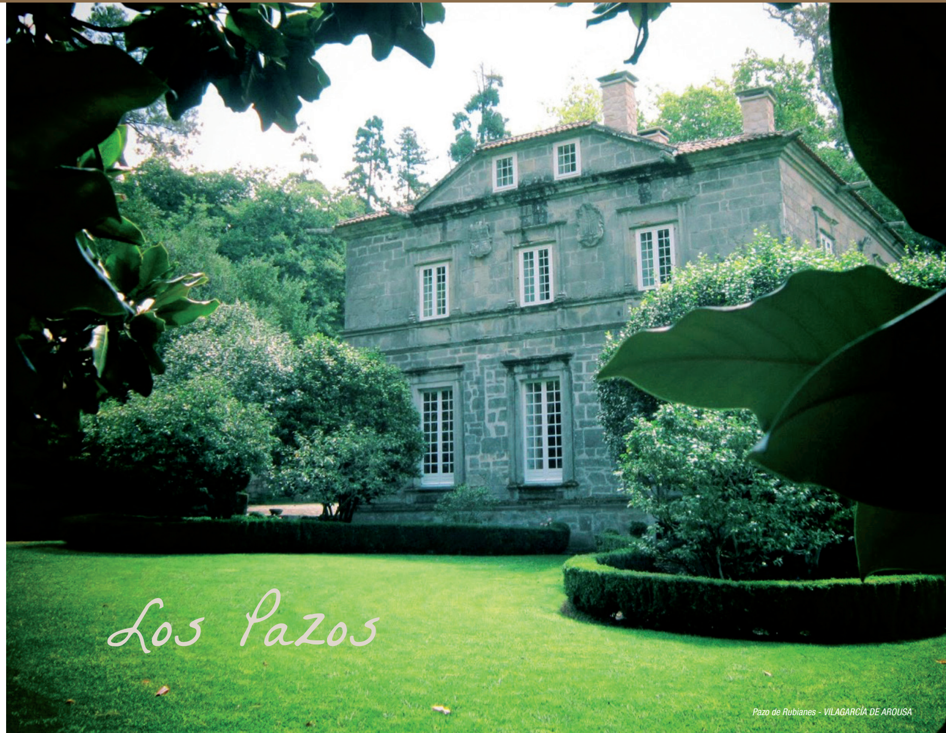
Pazo de Rubianes - VILAGARCÍA DE AROUSA