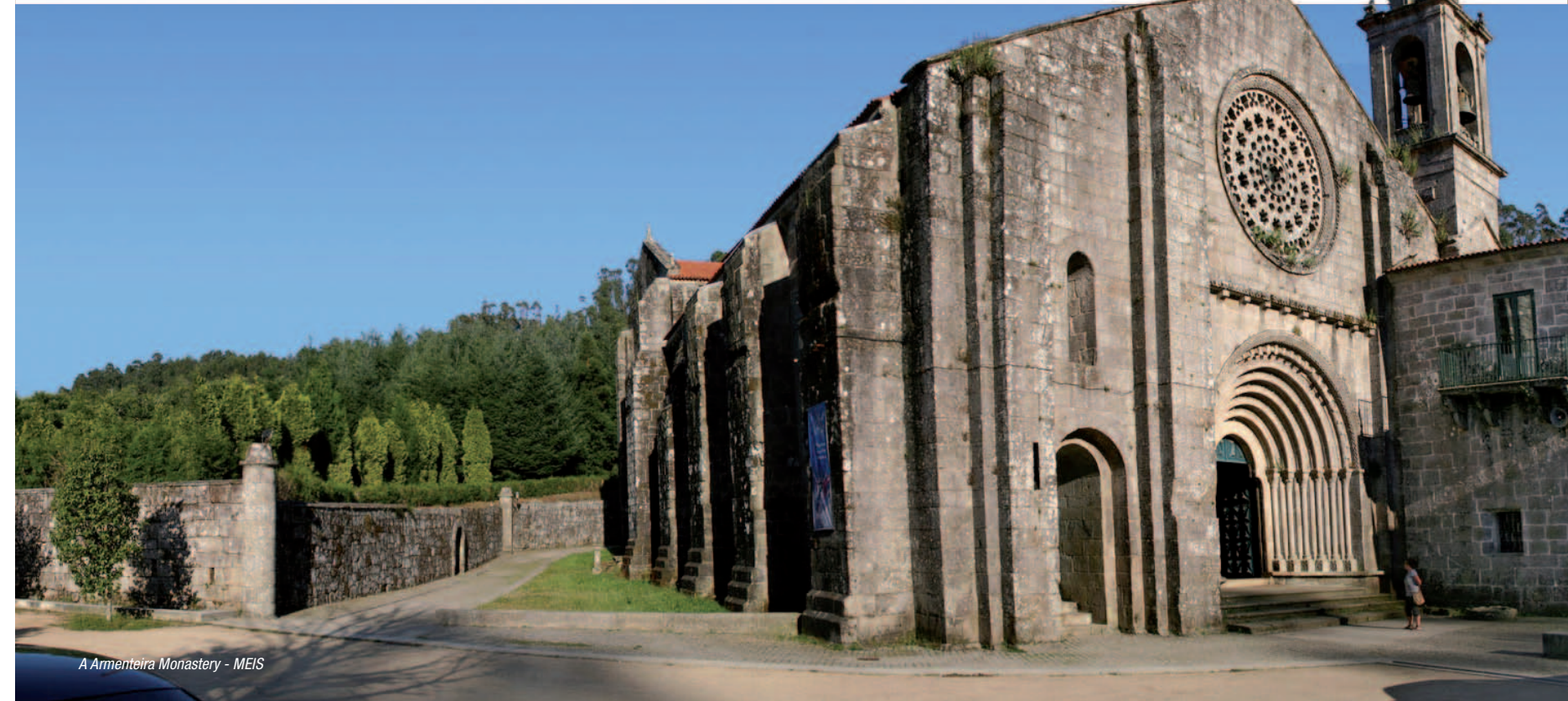
A Armenteira Monastery - MEIS