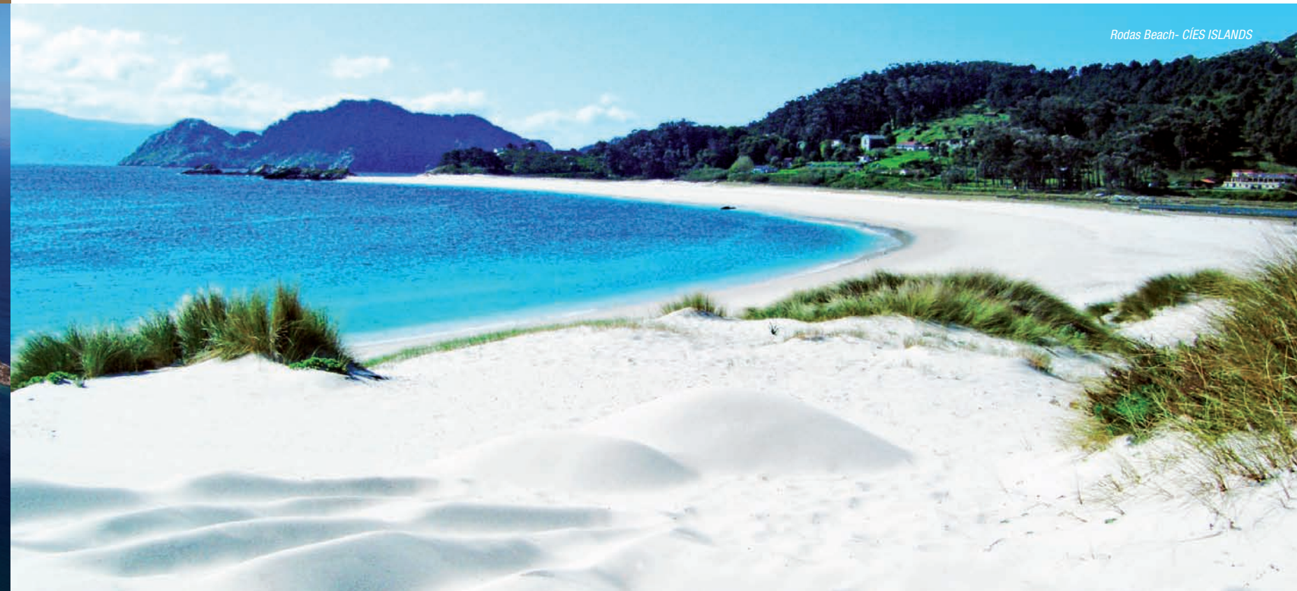
Rodas Beach - CÍES ISLANDS