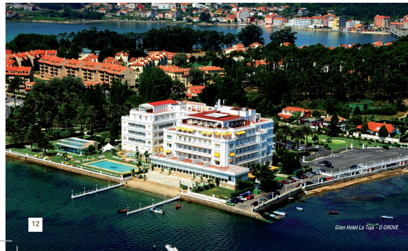
Gran Hotel La Toja - O GROVE

Undoubtedly La Toja is the biggest reference of the Galician islands. It is considered the ideal destination for excellence tourism offering the possibility of staying at four and five star hotels, likewise numerous activities to do at the spas, golf course, shooting range, and the Great Casino completing a diversified quality offer in a privileged environment.