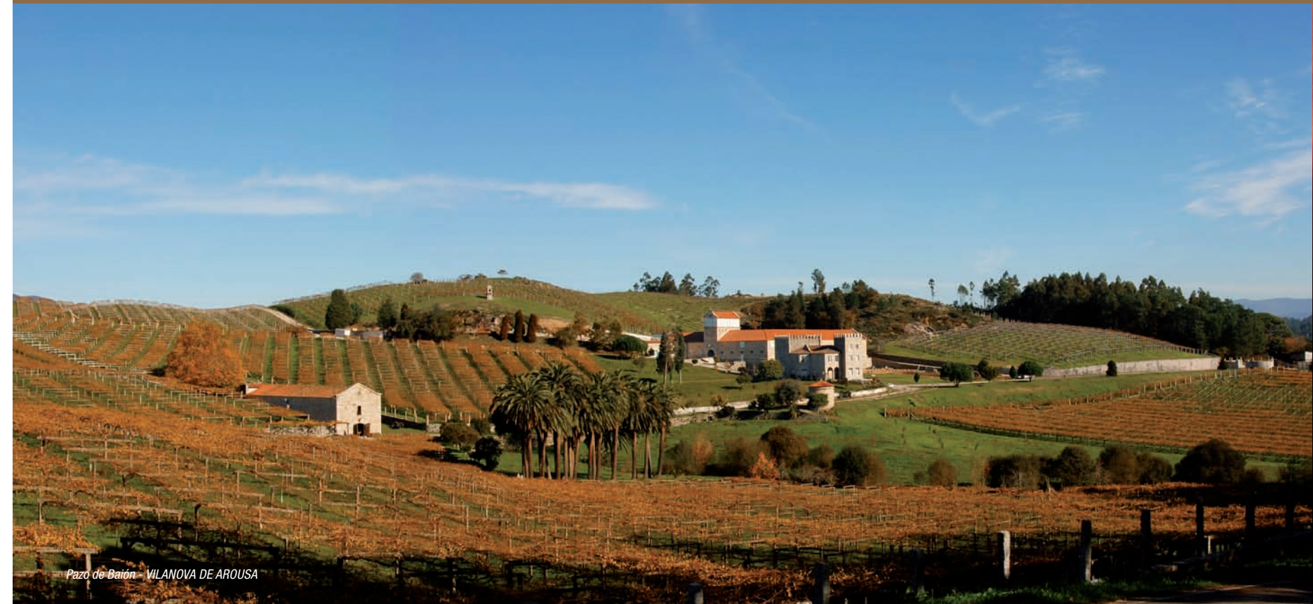
Pazo de Barón - VILANOVA DE AROUSA