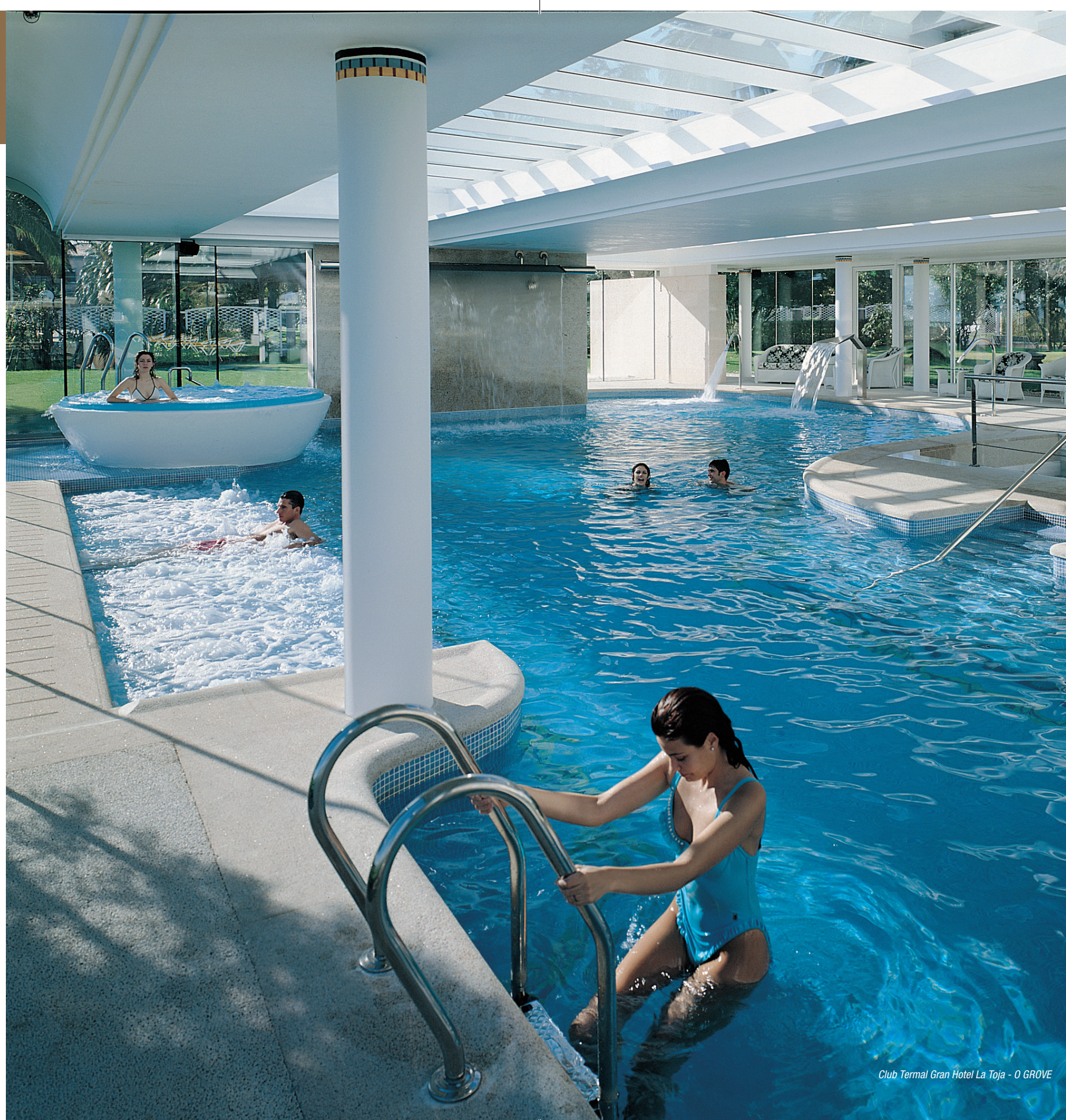
Club Termal Gran Hotel La Toja - O GROVE

A stay in Galicia offers multiple occasions to enjoy your spare time. You can find relax and tranquillity with your family during a whole day in contact with the sea hiring a private boat with crew to discover the most beautiful corners and most spectacular views.