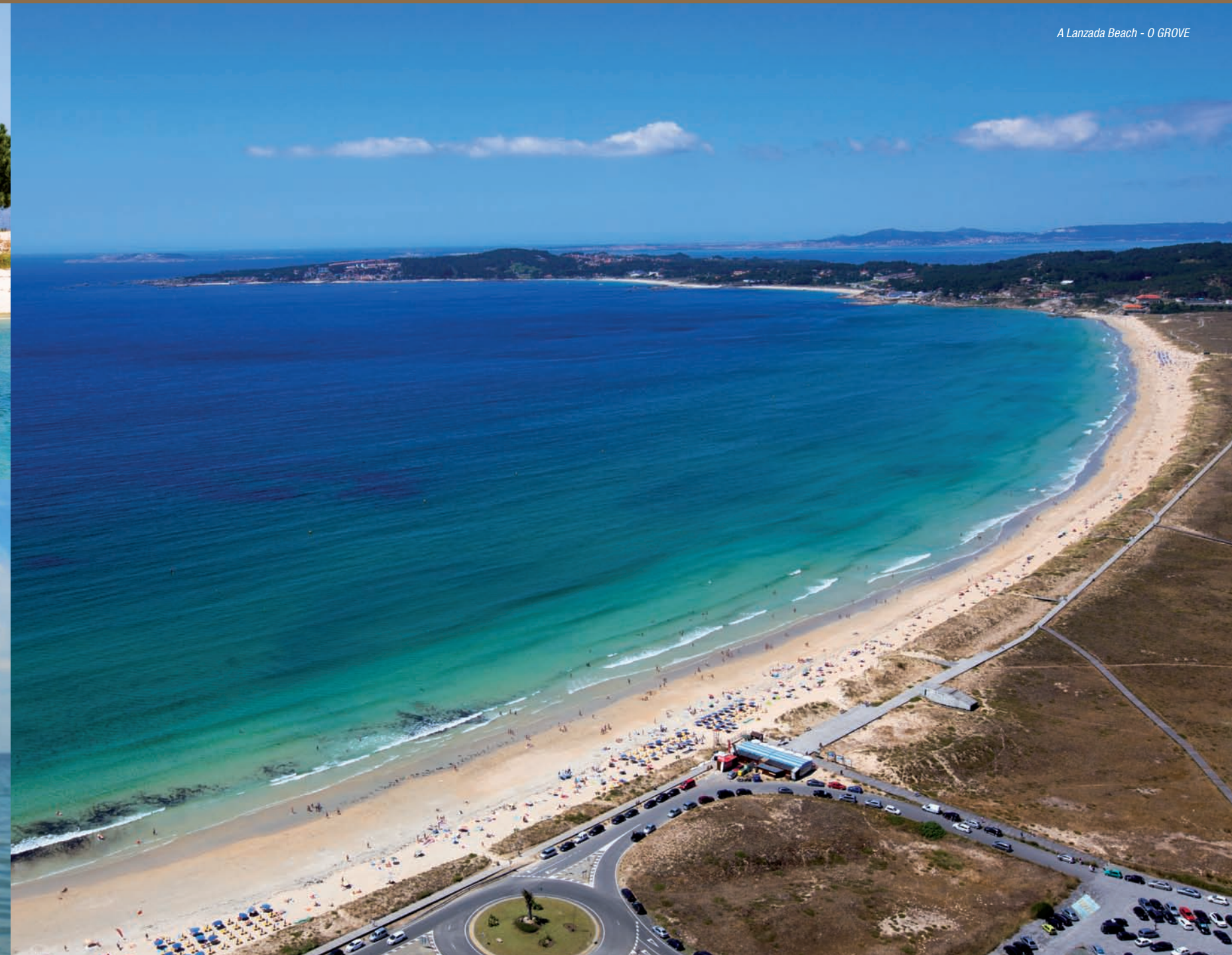
A Lanzada Beach - O GROVE