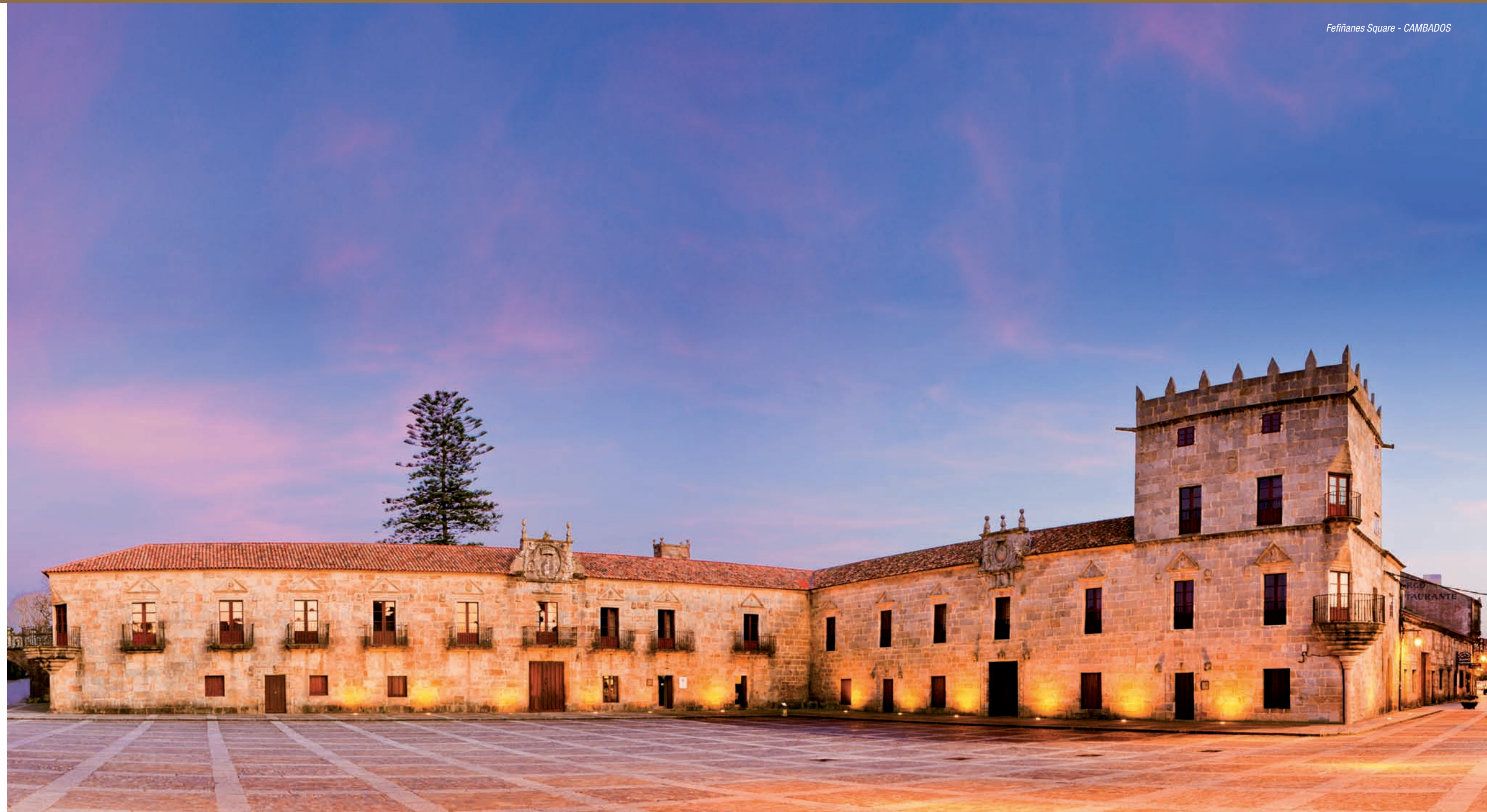
Fefiñanes Square - CAMBADOS