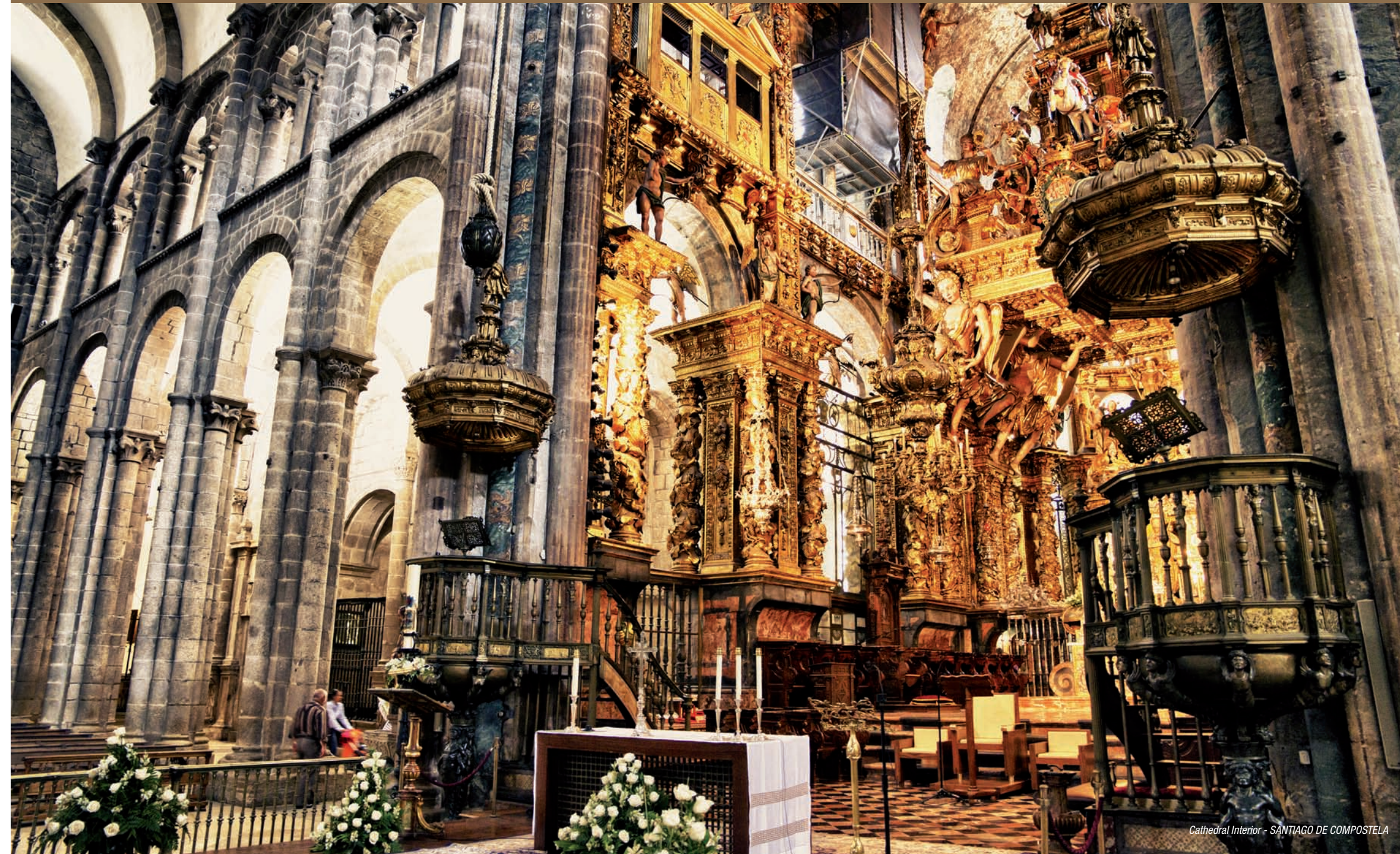
Cathedral Interior - SANTIAGO DE COMPOSTELA

There are different official routes, including the noteworthy: French, English, Portuguese, Silver and Sea Trails, whose final destination is the Apostle's crypt and traditional hugging of the saint's figure both found inside the monumental cathedral.