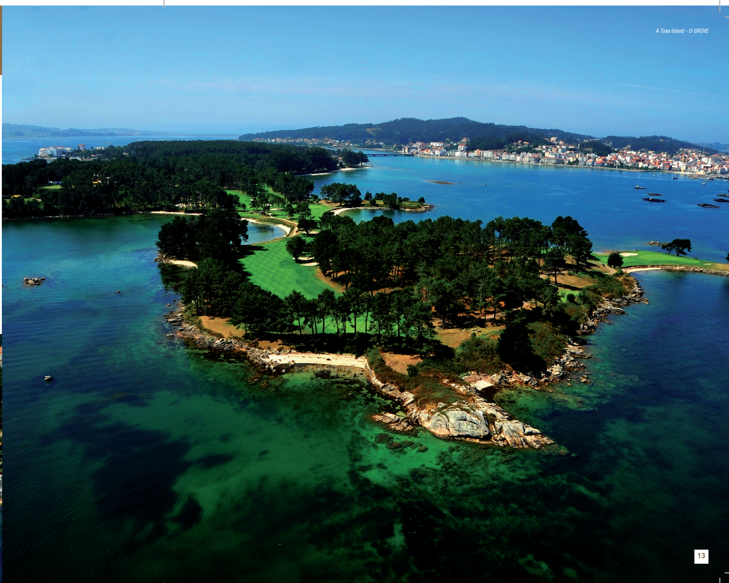
A Toxa Island - O GROVE