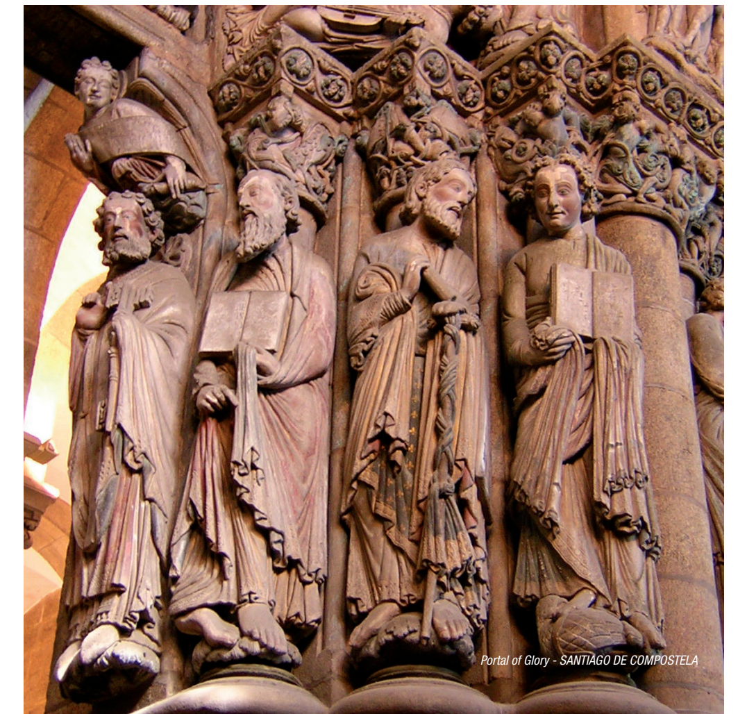
Portal of Glory - SANTIAGO DE COMPOSTELA

Equally noteworthy are: the market square, old city market still operational, the Platerías Square or Quintana Square. Undoubtedly walking through the narrow cobbled streets of Santiago is an unforgettable experience.