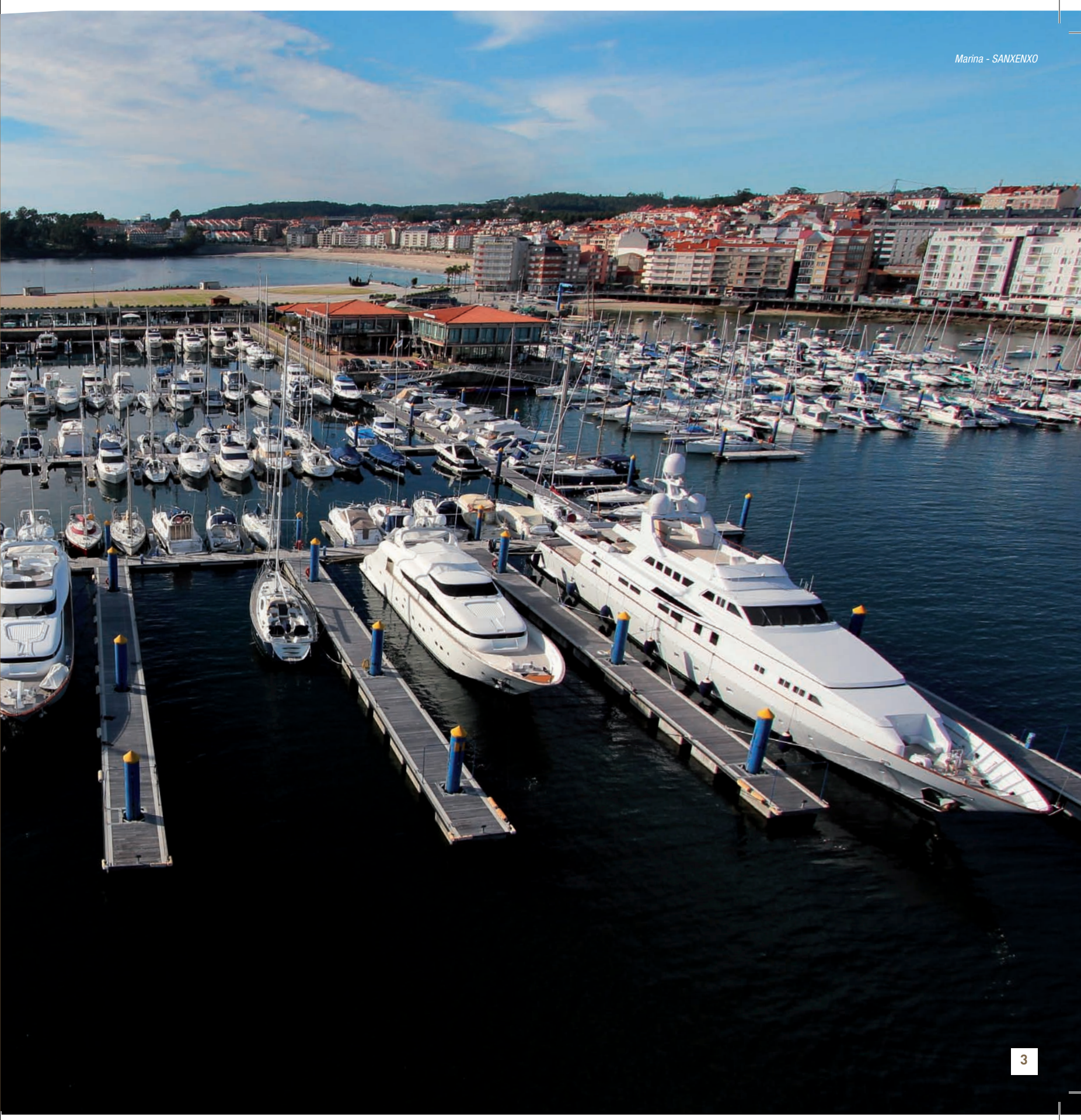
Marina - SANXENXO

CREDITS: Front cover: Family - Author: Warren Goldswain - Source: shutterstock | Page 8: Family - Author: Pavel Losevsky - Source: Fotolia | Page 24: Cathedral Altar - Author: Fcg - Source: shutterstock | Page 25: Portal of Glory - Author: Pedronchi - Source: Flickr | Page 30: Octopus- Author: Dulsita.