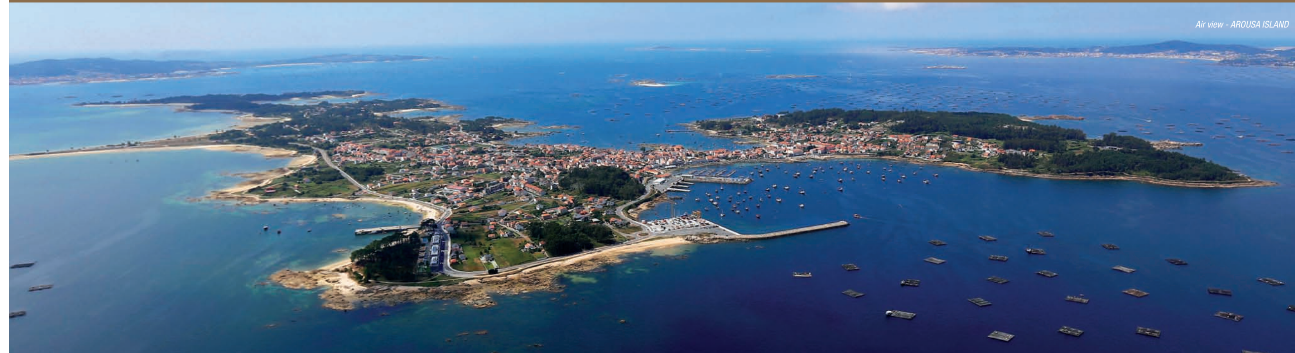
Air view - AROUSA ISLAND