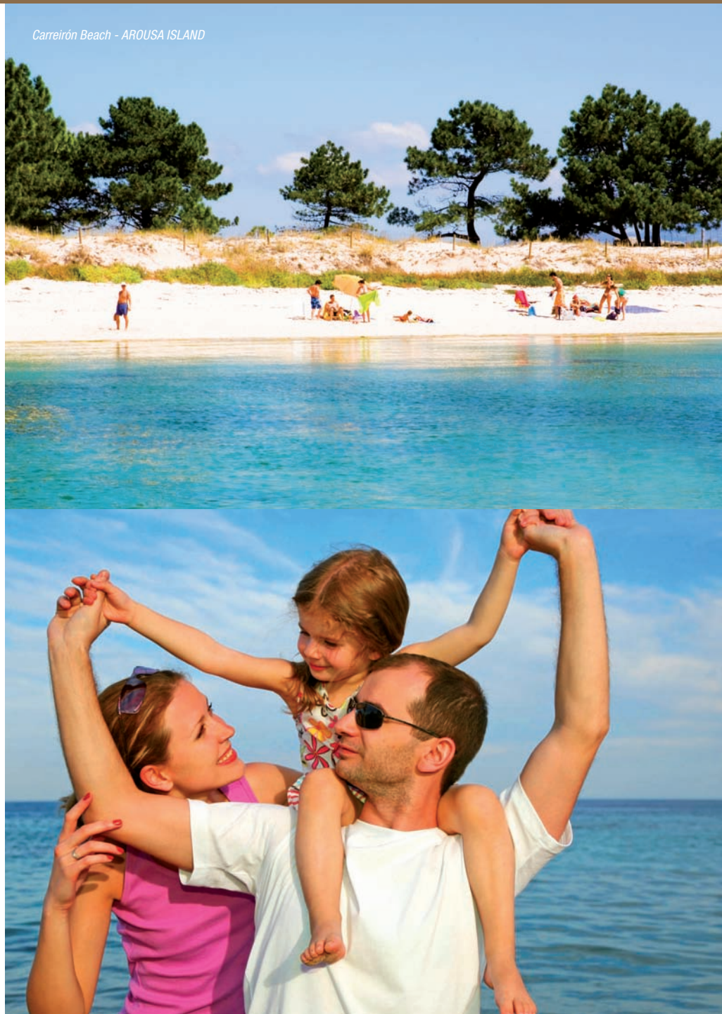
Carreirón Beach - AROUSA ISLAND

Moreover, the small coves offer the possibility of relaxing and enjoying the picturesque sea landscapes.