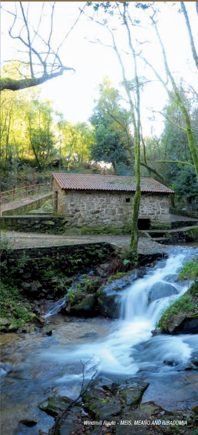
Windmill Route - MEIS, MEAÑO AND RIBADUMIA

There are beautiful routes in the Salnés Region where you can discover the secrets of the old water mills. You can stroll through paths alongside our riverbanks and enter the leafy forests to discover the most beautiful spots of the inland districts.