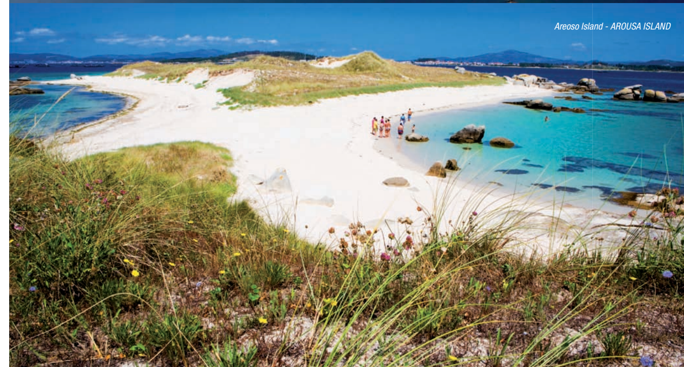
Areoso Island - AROUSA ISLAND