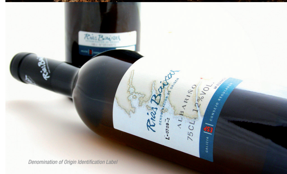
Denomination of Origin Identification Label